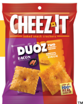
Cheez-It Duo ® Bacon / Cheddar