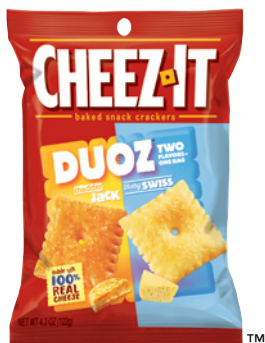
Cheez-It Duo ® Cheddar Jack / Baby Swiss