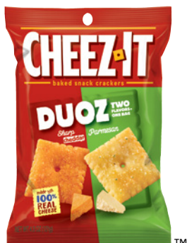
Cheez-It Duo ® Sharp Cheddar / Parmesan